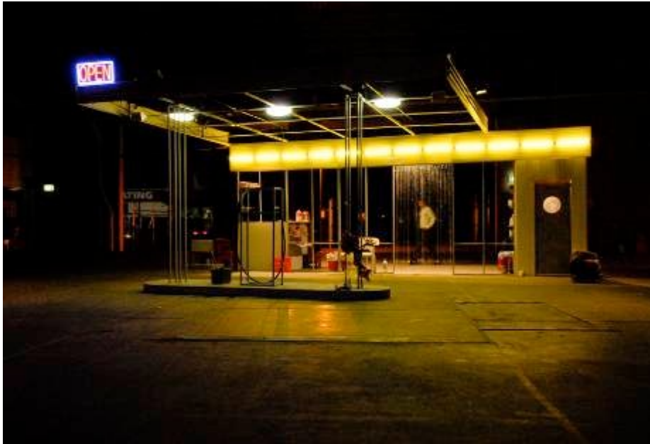
Figure 3. The Last Highway .

RO: Our work does sit in a context in which there is a strong interest in reality in the theatre, which is characterised firstly by a thirst for the “real”, and then secondly, by other ways of finding the “real”. Our work fits in here in two ways. The interviewees’ words are being given to the audience with fidelity – with as much fidelity as the actors can achieve, in that they are listening exactly to the recordings and are replaying to the audience the exact timing of the interviewees’ speech. This creates a documentary feel, because obviously the way people speak is quite different to how actors present written text. While this is all presented with fidelity, we then cast against type – which is essential when four cast members are representing 28 characters. While there is something very unreal about this, it is what liberates the audience to explore the believability of the whole scenario, because they’re not being asked to believe that Mohammad is a girl, they’re just being asked to believe that he is saying the words of a girl. Because they are not being asked to believe that “that guy” is an 80 year old woman, they are suddenly liberated to hear the truth of “her”. What they see is really at odds with what they hear. So, politically speaking, backgrounds become fluid and free in terms of gender or race. It is almost as if the audience begins to see through the people on stage and to instead see something real. They are then challenged to hear in a different way.