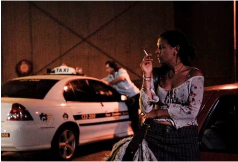
Figure 1. The Last Highway .

AT: We need to destabilise what we expect from people in trauma. When someone is in crisis, they tell their story to the social worker, then to the mental health worker, and then to someone else and so on, until they have retold their story many times. In essence, they are reliving trauma and crisis, potentially without a sense of containment. When people are consulted instead of interrogated, they are more likely to cooperate and, ideally, collaborate. For instance, when I was working on The Last Highway , everyone said to me ‘You’ll never get street based sex workers in Western Sydney to come to anything once, let alone twice.’ And yet, that became the highest attendance of any consultation group. Even more remarkably, one consultant who had worked on the highway for a number of years reached a point of feeling that she no longer had to work on the highway (but continued working in a safer environment) and another worker developed an exit plan for herself tied in with starting a TAFE course. Both of these women directly attributed their participation in the consultation process to their decision making process. The process proved that they had something to offer, that they could deal with it, and that they were of value.