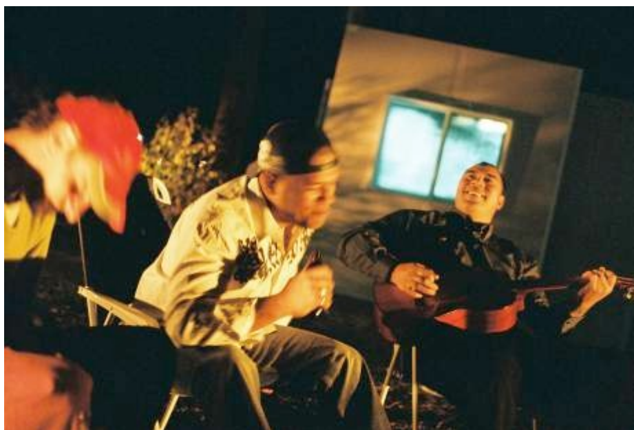
Figure 5. Back Home .

BT: The strength of works such as Back Home seems to be the connections they make between the multiple layers of traumatic wounding that travel largely unrecognised in mainstream narratives of Australia – the connections between colonialist histories of silencing and the contemporary invisibility of Arab identities, for example. In Back Home , the four male characters compete over who is the most disenfranchised by their ethnic positioning – the Palestinian NOMISE yells to his Indigenous mate: ‘Your people have been getting fucked with for the last 300 years, my people have been getting fucked with since the beginning of time’. This is at the same time as they experience all kinds of equivalencies in terms of their shared social dispossession and displacement. In Stories of Love and Hate , Arab-Australian identities are made differently visible through the staging of conflicting narratives within their own community: the Lebanese father is nostalgic for Beirut, and the younger kids feel that they belong to Punchbowl, but not to Australia. In all of this, there seems to be a crisis in masculinity that goes hand in hand with the silencing of these alternate narratives of identity, and I wonder if you can discuss the connection between the two?