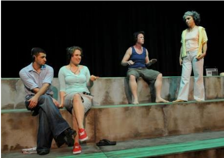
Figure 4. Stories of Love and Hate.