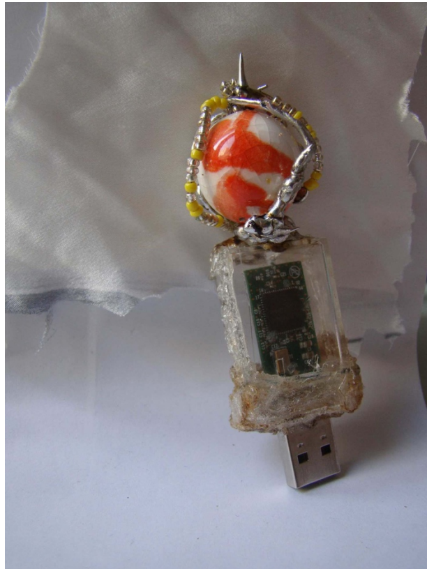
Fig. 1. Contextual image for iruuu's [musical.(function Transform(){blau}*(euph.OR.i.[a](NGE)))] , presented at Acker Stadt Palast, Berlin, 2017, curated by M.l/mi1glissé (Groups and Individuals).