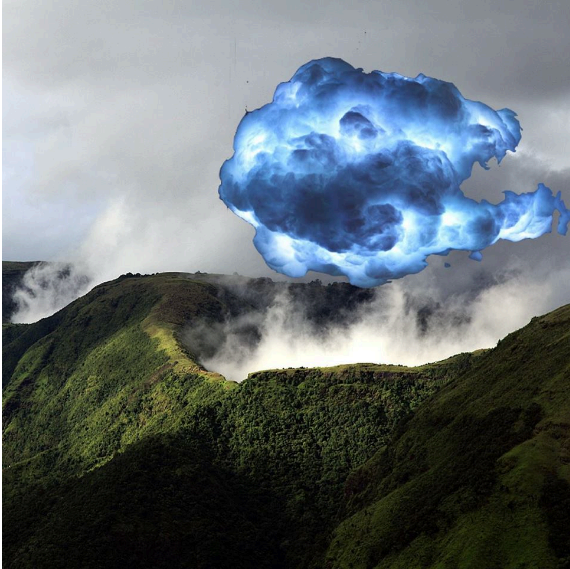
Fig. 3. Promotional image for Agata Siniarska's HYPERDANCES (2015)

Her unfolding body of work, like [musical.] , proposes dynamic contingency between all kinds of bodies and matter; entanglements not contained but produced by the situations they constitute on a limitless, planetary scale.