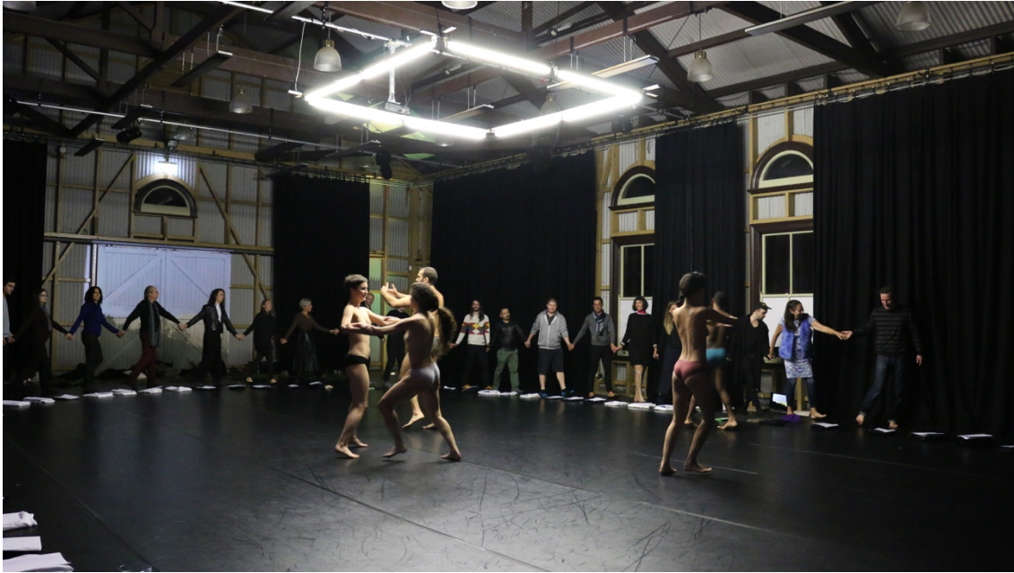
Fig. 4. Performance documentation of Lilach Livne's Transcending, for Peace , presented as part of the 20th Biennale of Sydney at Critical Path, Sydney, 2016.

For the particular frame of the BoS, we developed a choreography that mediated separations between roles, relations and participation in a layered, subverted process of prayer. This iteration's TIME/SPACE was an evening-length performance (at 7pm and 9pm, for approximately 2 hours) in a studio formatted with objects, light and moving group structures as a communal space to host a mass prayer action that we facilitated to produce a shared encounter.